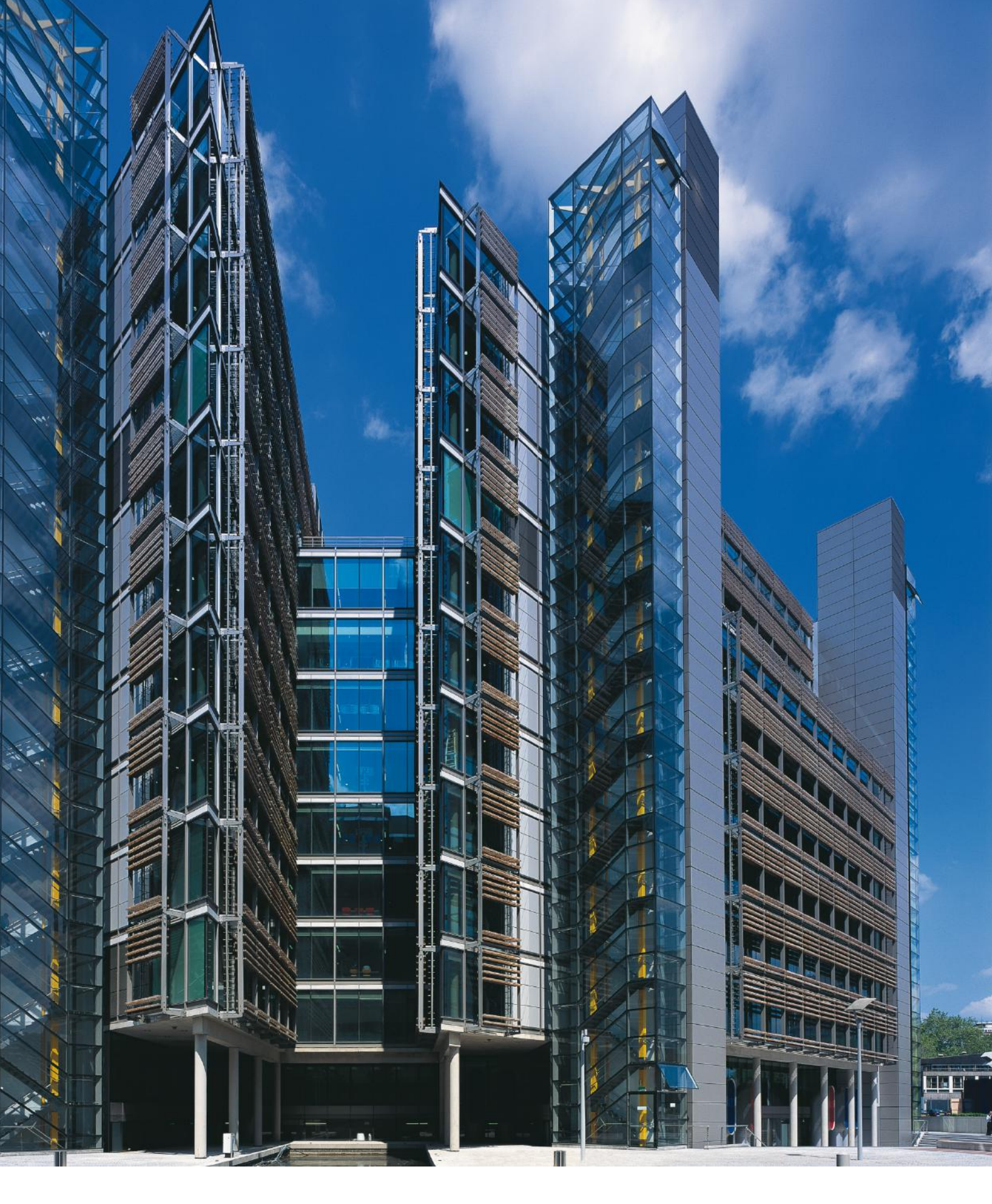
Paddington Waterside London