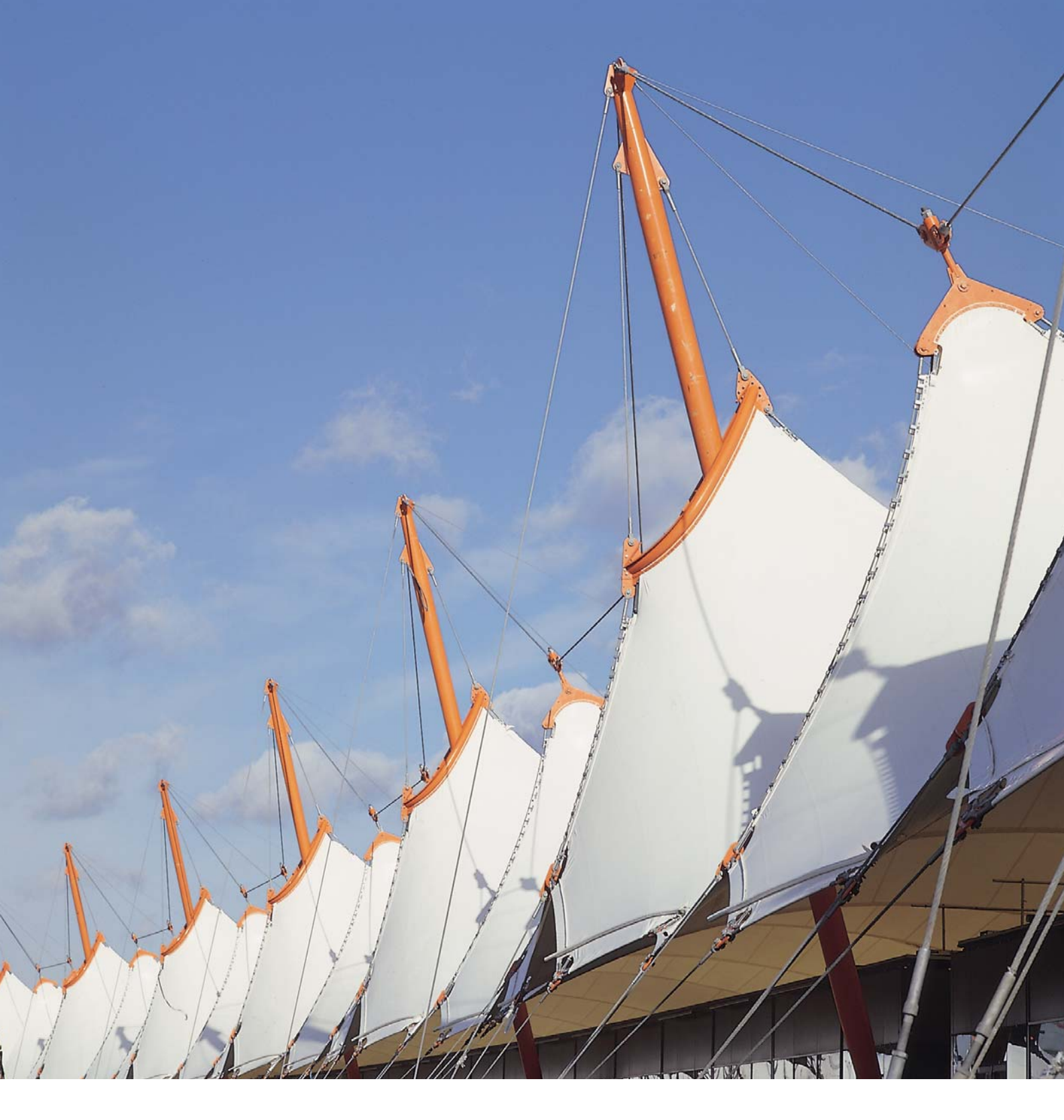
Designer Retail Outlet Centre